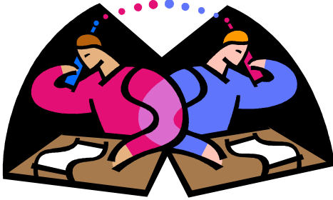
Senior Support Line 1-800-235-9980

Senior Support Line: This service was launched March 1 for residents 60 and older who are living alone, feeling isolated or depressed, who have few or no connections to family or friends locally. The Camarillo Health Care District implemented this program to serve as a vital link between seniors at risk for depression and the rest of the caring community. The senior support line can offer important information and support to someone who might not have anywhere else to turn.